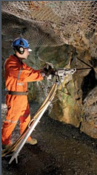
Pneumatic Rock Drills